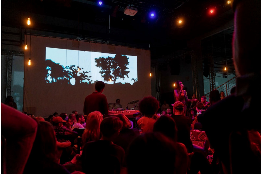
K.ZIA with »K.ZIAs Living Room Experience«

To conclude the festival, Commissioned Works were in the spotlight. The Berlin avant-garde trio GEWALT took the audience on a voyeuristic, to-the-limit experience with »Du bist Gewalt«; in contrast, K.ZIA created a space full of human warmth and affection with »K.ZIAs Living Room Experience«. And Sanni Est led the audience into a world of personal transformation that was both healing and frightening in »Photophobia«.